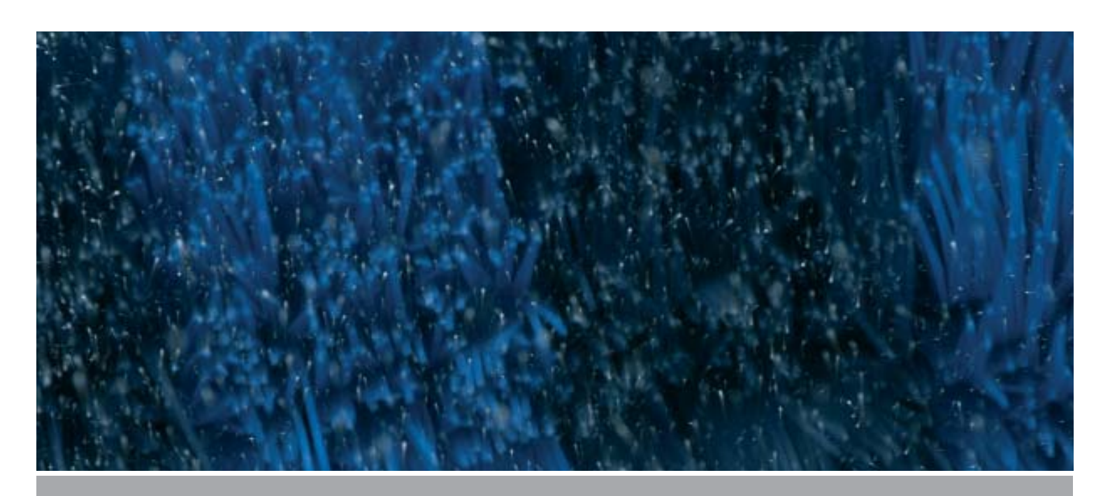
WASHTEC AG – Report on the Period From January 1 to June 30, 2006